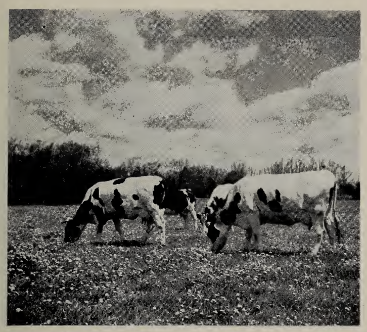
Dairy Herds from six Reform Institutions, produced . . .